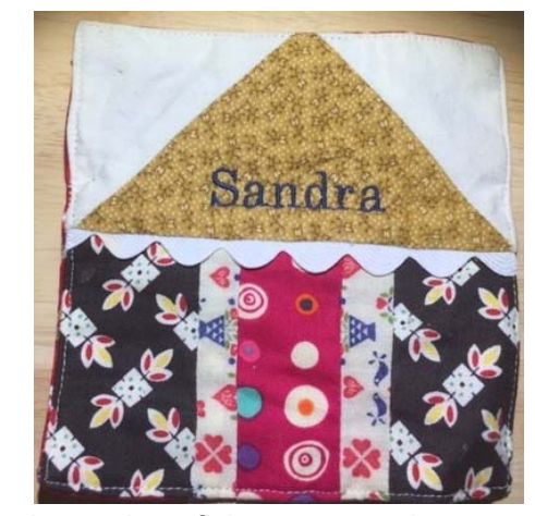
Step 1: Make the roof by using the stitch and flip method to make a flying geese unit.